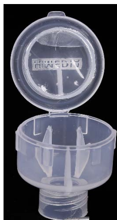
Saliva Collection Funnel with Stabilizer

Each unit of HiMedia’s Salivol™ contains one saliva collection funnel with nucleic acid stabilizer and a collection tube.